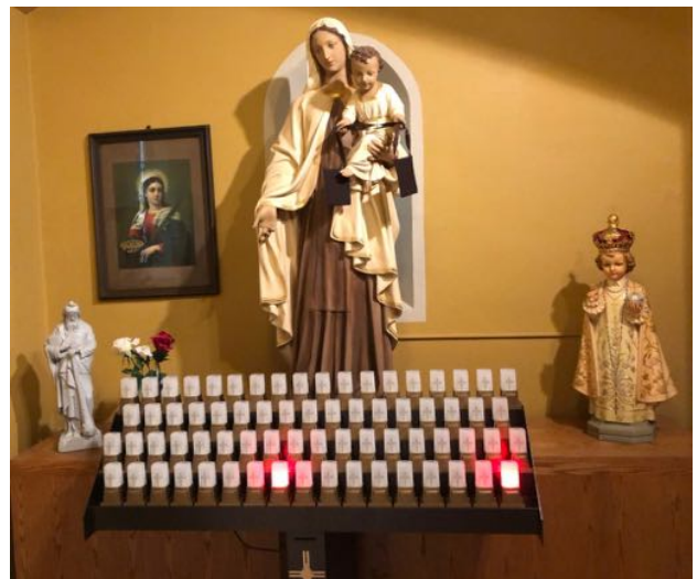
OUR LADY OF MT. CARMEL