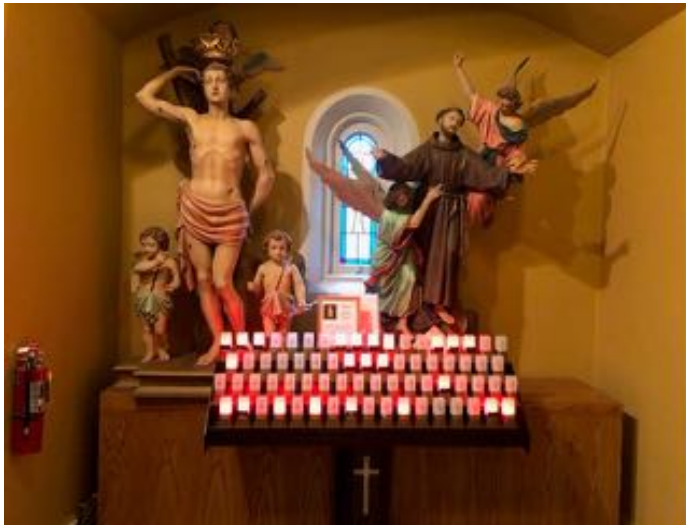
ST. SEBASTIAN ST. FRANCIS OF ASSISI